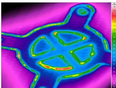
Temperature distribution during laser cutting of a CFRP component

With two separate filter wheels, each with five positions, spectral anomalies during CFRP processing can be detected at a level of accuracy in temperature measurement of \pm 1\% . This high level of accuracy can only be achieved by the implementation of specially developed precision calibration methods to use the full dynamic range of the infrared detector as well as the integration of several calibration curves to guarantee for long-term stability and drift compensation. Using InfraTec's special lenses the smallest detail can be well resolved from a relatively large and therefore safe working distance.